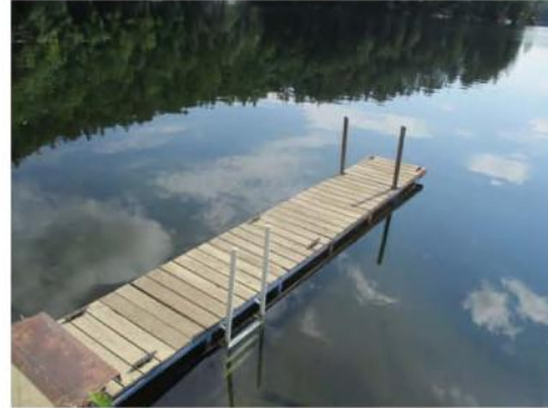
Image of dock that is normally 18 inches above the water

Water Level - The torrential rains we received this summer made it difficult to maintain an acceptable water level even though the boards had been taken out at the dam. NYS DEC direction is for water level at +/- 4 inches. Officially, the water level is controlled by adjusting boards in the State dam. July's rain total was impressive at some 20 inches. At the height of the rain the lake topped out at plus 10 inches. For those wondering why the lake level might have seemed excessively high this Fall, the lake received some 5 inches of rain from the end of October till the 2nd week in November. A wet season at times for sure.